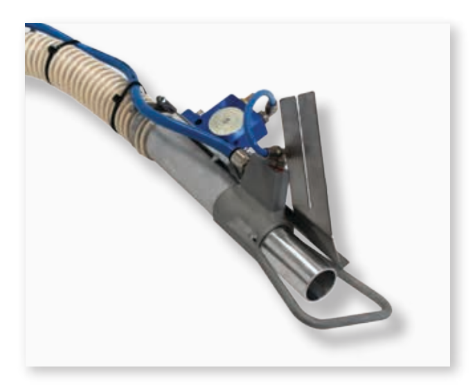
The Venturi Feeder's wand design allows for easy use with many types of adhesive totes and containers.

Valco Melton's range of adhesive application products offer a complete selection of hot melt components and support equipment: